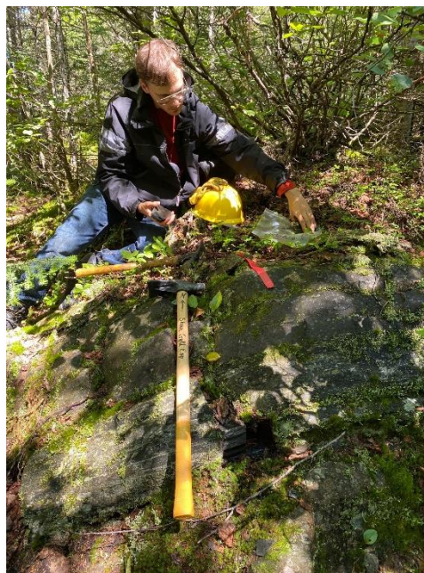
Figure 4: Crew member preparing a rock sample.