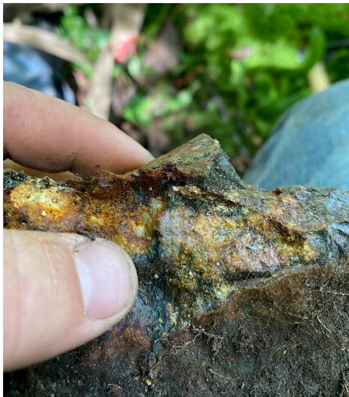
Figure 5: Volcanic rock sample with hydrothermal alteration and pyrite mineralization.

The Company's 43-101 Technical Report indicated that the Phase 1 exploration program could be completed in the summer of 2021, to be followed by a Phase 2 exploration program involving 2000m of diamond drilling to test favourable results from Phase 1. Due to the impact of COVID-19 in 2020 and 2021, the Company's exploration programs have been delayed. The Phase 1 work contemplated in the 43-101 Technical Report is now expected to be completed by early September 2022. At that time, the collected soil and rock samples will be submitted to Activation Laboratories Ltd. ("Actlabs") for analysis, which should take approximately two months to complete.